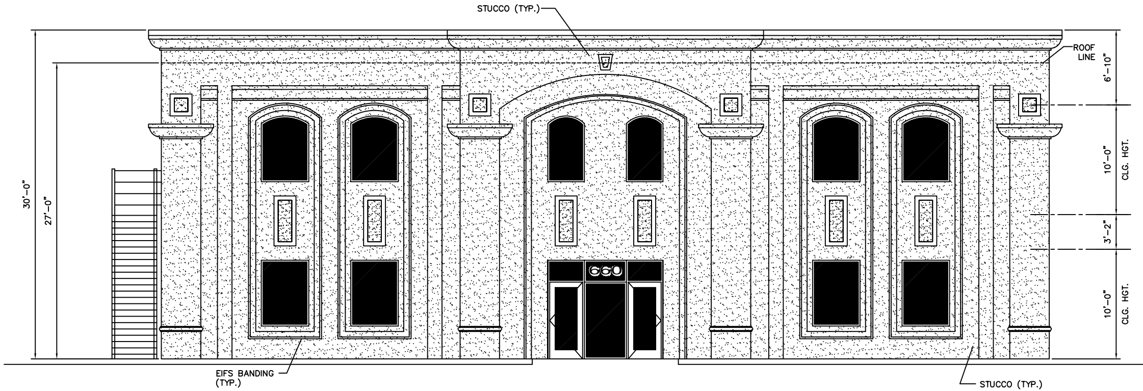
FRONT ELEVATION SCALE: 1/4"=1'-0"